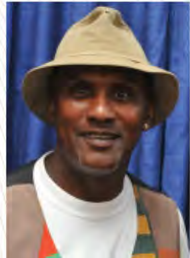
2/20/1956 – 5/23/2013