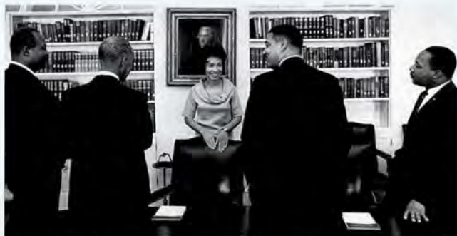
James Farmer, Roy Wilkins, Whitney Young, and Dr. Martin L. King, Jr.