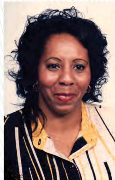
2/21/1951 – 4/19/2014